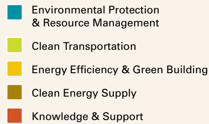
Figure: Direct production jobs in Washington's Clean economy sector in 2010.